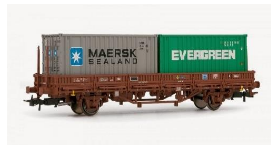
Fig. 4. Container [6].