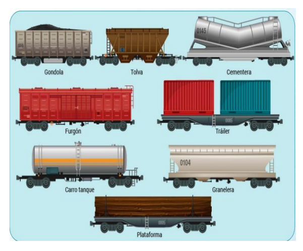
Fig. 3. Railroad transportation [6].

Loads and dimensions are stipulated in international standards [6].