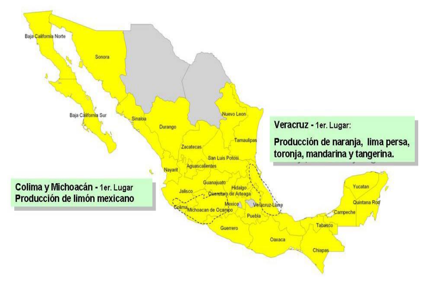
Fig. 7. Citrus production in Mexico.